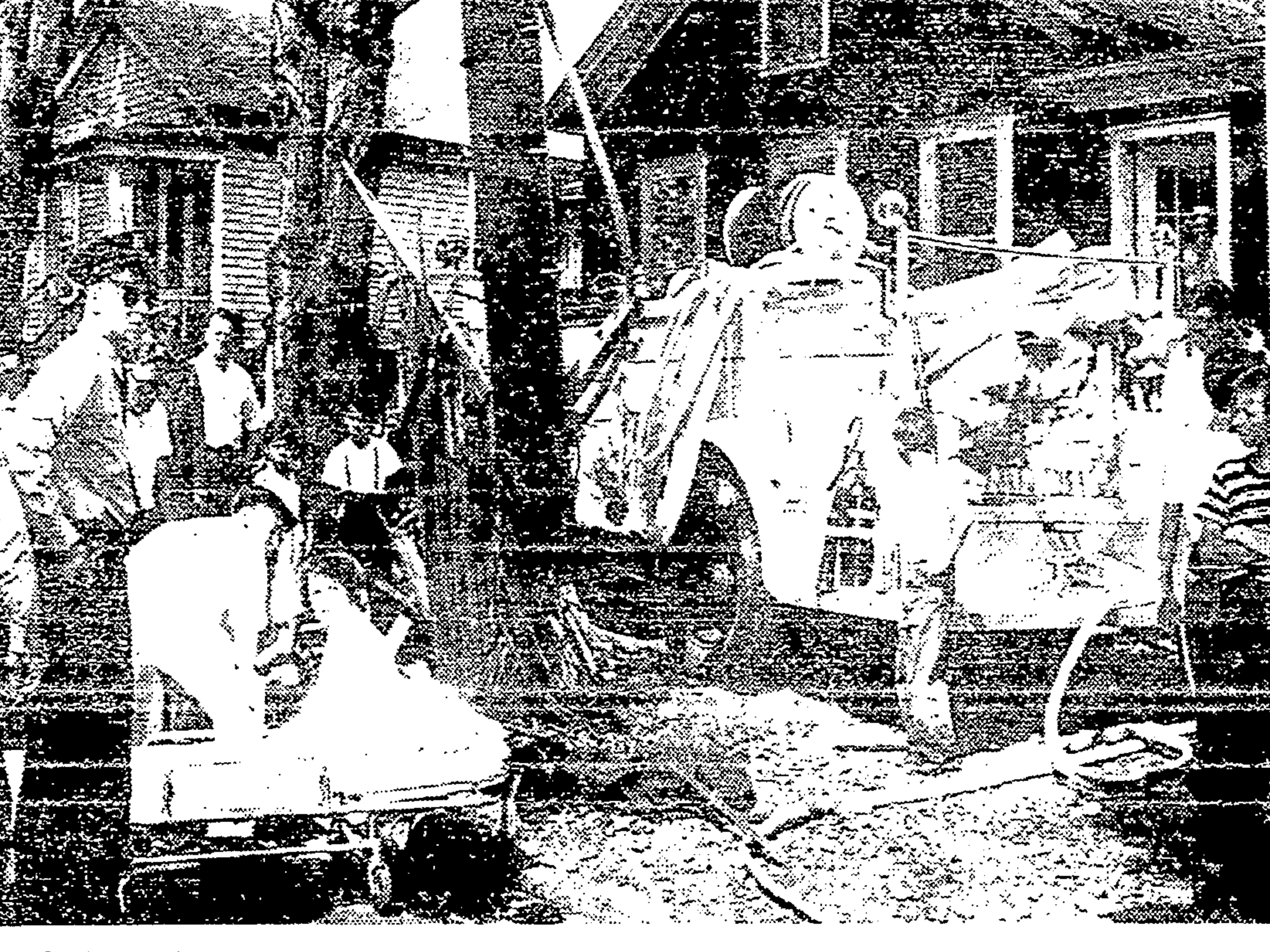
FOUR FIREMEN WERE INJURED when this 1,000-gallon pumper from Engine Co. No. 2 failed to make a turn at Butternut st. and Grant Blvd. The truck leaped the curb, smashed into a tree, sheared off a telephone pole and hit a second tree before it came to a stop on the sidewalk in front of 1518 Butternut st.

APPROXIMATELY half the upstate delegation to the Democratic National Convention is expected in Syracuse Monday to meet Senator Estes Kefauver of Tennessee, front running candidate for the Democratic presidential nomination.